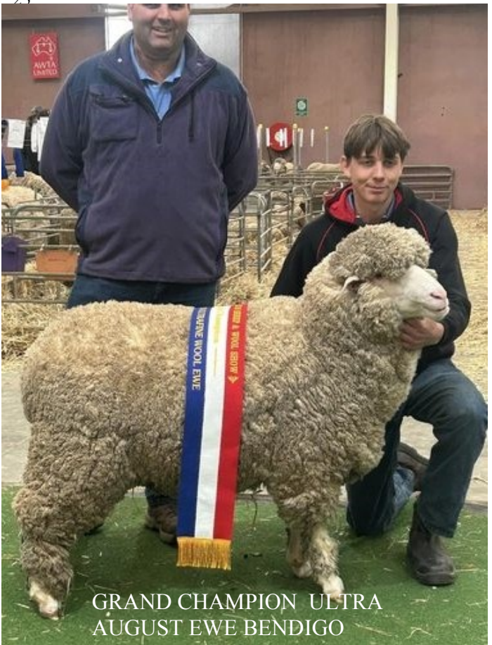
GRAND CHAMPION ULTRA AUGUST EWE BENDIGO