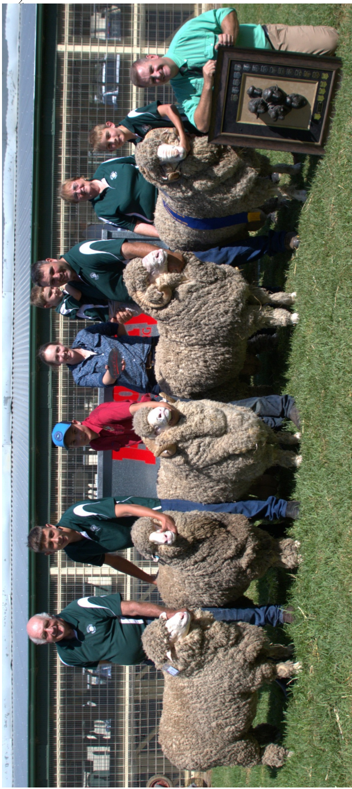
Prestigious Roger Birtles Perpetual Trophy, sponsored by The Land, March shorn Merino