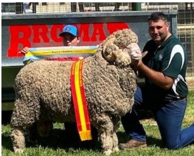
Junior Champion March Shorn Ram,

Great Southern Supreme Merino Show moved to Bathurst this year which was a huge success with a large number of entries of Merino Sheep of a very high standard. Greenland Merino Stud travelled to Bathurst as a pre-cursor for Sydney Royal Easter Show . Greenland's biggest honour was to win the Prestigious Roger Birtles Perpetual Trophy, sponsored by The Land, for the best 5 Merino Sheep March Shorn Group: 3 rams and 2 ewes. This category is always difficult to win with many entries of a high standard. Spokesperson for the four judges commented that they were a very productive group of a uniform type with good skin type of positive testing wool. Greenland Merino Stud achieved 10 Broad Ribbons including Champion March Shorn Ultrafine Wool Ewe, Elders Champion August Shorn Ewe, Champion August Shorn Ultrafine Wool Ewe, Junior Champion March Shorn Ram, Junior Champion August Shorn Ewe, Reserve Champion March Shorn Fine Wool Ewe, Reserve Champion March Shorn Fine Wool Ram, Reserve Champion March Shorn Superfine Wool Ram and Third in the Fabstock March Shorn Pairs.