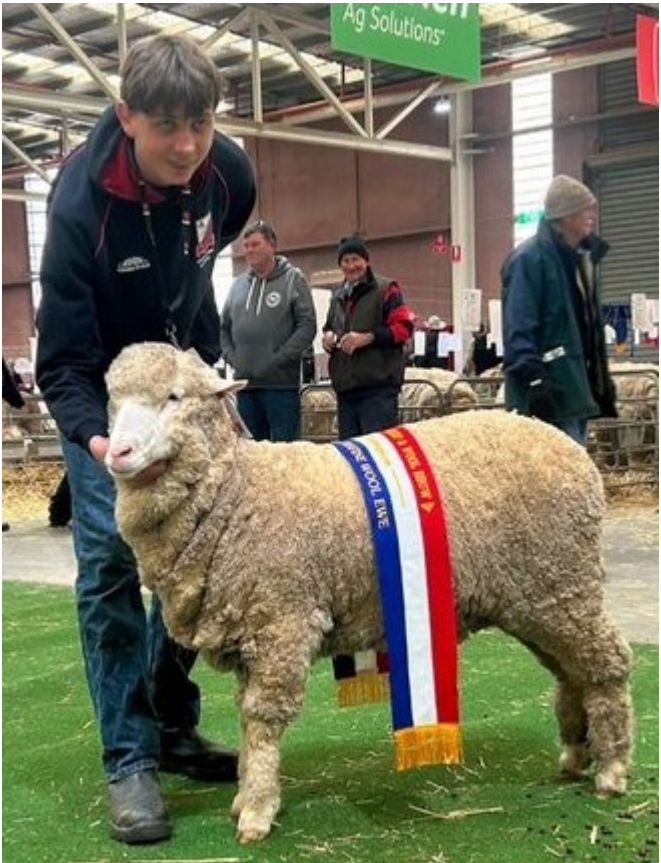
Grand Champion Ultra March Shorn Ewe BENDIGO

One of the most important decisions to consider when breeding Merinos is to aim for a well balanced sheep. To do this you must avoid focusing on extreme traits. The best performers for balance is the average or a little above average for all the measurable traits. The ultimate aim at Greenland has always been to breed the very best quality wool as possible. Wool quality is the key to success in eliminating fleece rot and dermatitis. The fibre must have distinct crimp definition with well aligned fibre of white waterproof wool with the correct chemistry. Good quality wool that dries quickly is the answer to dramatically reducing fly strike and thus extremely important as the industry is already experiencing chemical resistance. Good quality wool and micron are key drivers for good competition at the wool sales