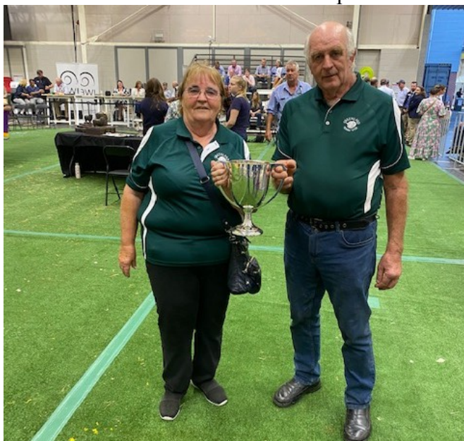
THE STONEHAVEN CUP